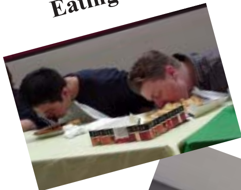
Tau Beta "Pie" Eating Contest