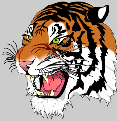
Figure 6.2: The tiger.eps from GhostScript